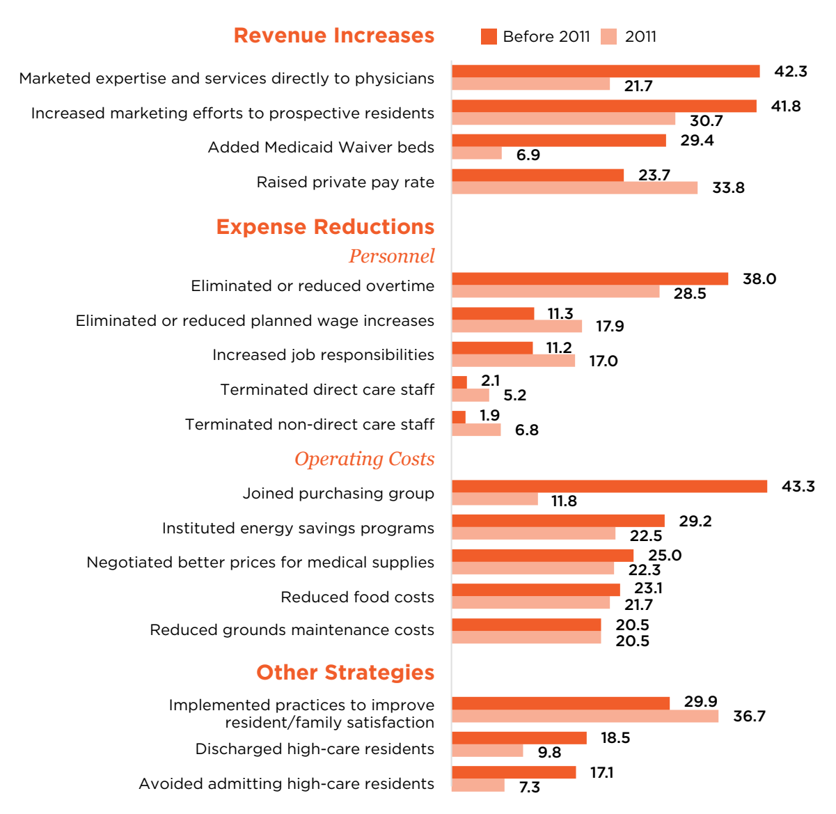
Figure 2. Residential Care Facility Strategies to Increase Revenues and Reduce Costs, 2011 and Earlier (percent)

Between 2007 and 2011 nursing homes increased the proportion of Medicare patient days from 13.7% to 14.9%, while at the same time reducing the proportion of Medicaid patient days from 63.5% to 61.1% (not shown) (Mehdizadeh, et al., 2013). Medicare daily reimbursement rates average $442 as compared to $167 for Medicaid, providing a strong incentive for nursing homes to increase the number of Medicare residents. Reducing food costs was common both in 2011 and before 2011 and was accomplished by fewer food choices, changing the dining style, and less expensive menu items. Implementing practices to improve resident and family satisfaction was also a common strategy both in 2011 and prior to 2011. Benefits from improved quality might include higher occupancy rates.